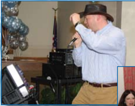
Nothing is better than karaoke for breaking down barriers among staff and Board members!