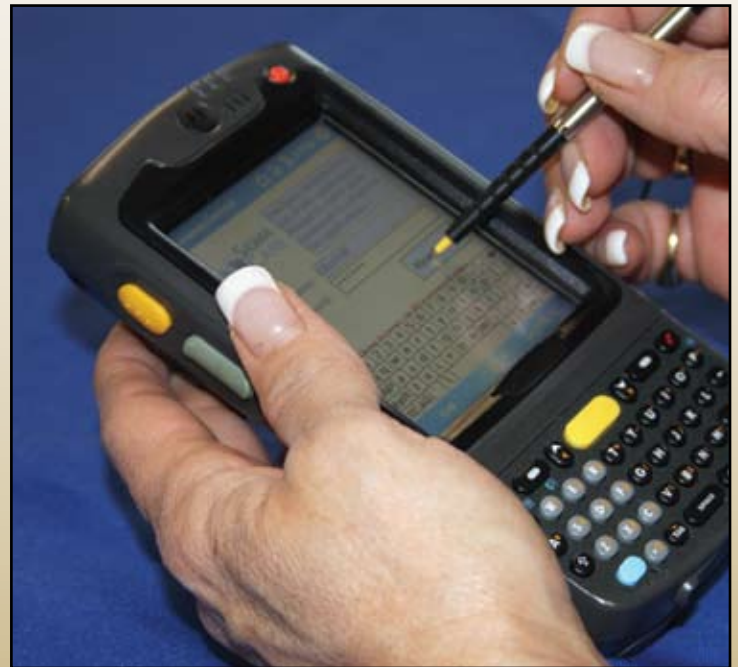
The Home’s transition to electronic medical records required training on computer software (top) as well the use of PDAs (above)”

The Home’s Board and staff leaders are also reading the tea leaves, and anticipating changes that may come through efforts at the federal level to reform healthcare, or at a minimum, reduce healthcare costs. Adopting a comprehensive EMR system now better positions the Home to react to future changes.